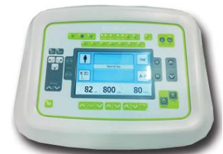
LCD OP console