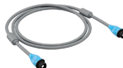
GlideScope Core QuickConnect Cable