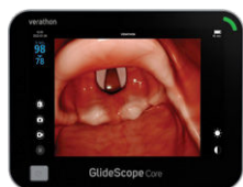
GlideScope Core 10