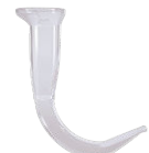
GVL 4 Stat

To learn more, visit verathon.com/glidescope